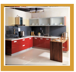
Kitchen Cabinet & Wooden doors