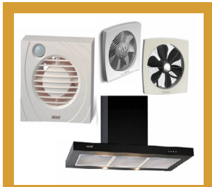
Cata (Spain) Hoods & Fan