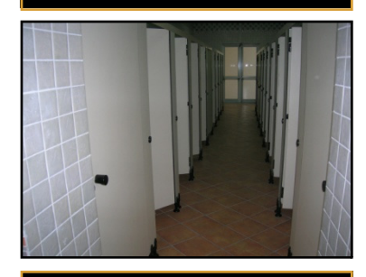
Corridor - Serv ocorp